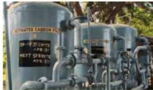
PSF and ACF