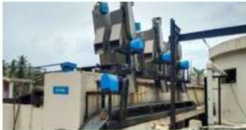
Bar Screen Chamber