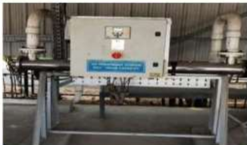
UV Treatment System