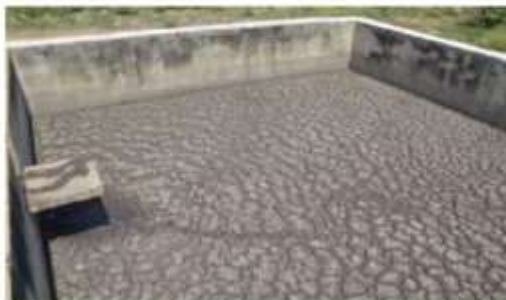
Sludge Drying Bed