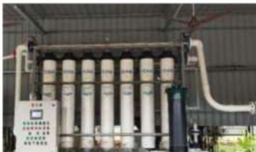
UF Treatment System