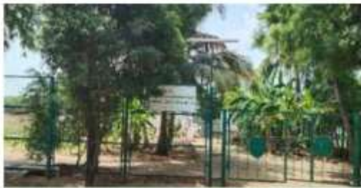
Existing Combined ETP 2500 KLD Capacity