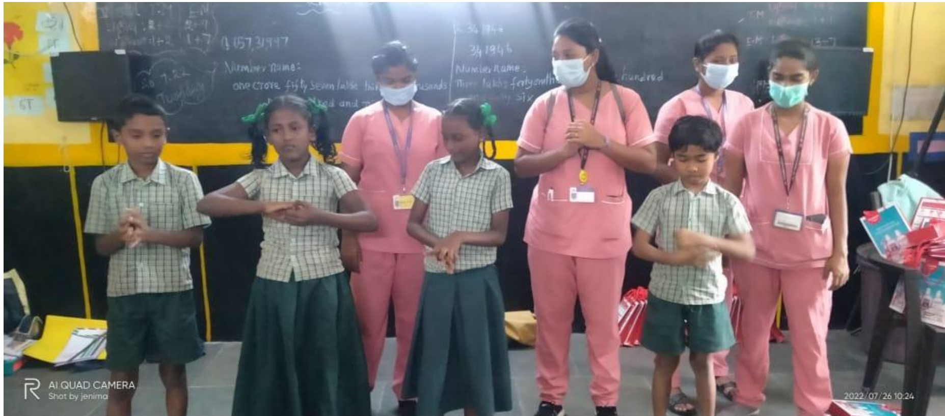
Hand hygiene demonstration by Nursing students