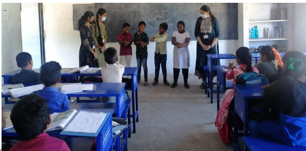
Health awareness sessions