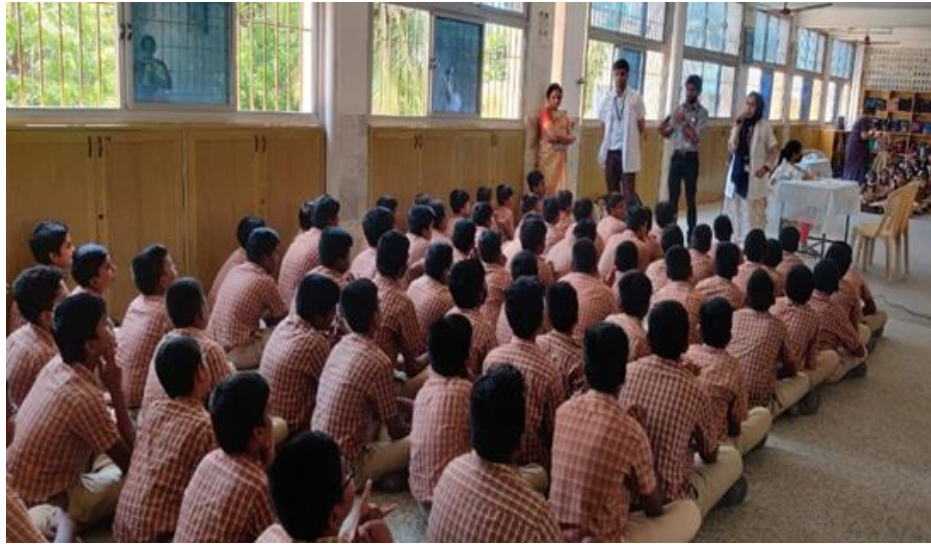
Health Education on hazards of tobacco and alcohol