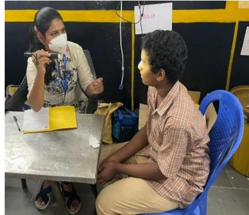
Dermatologist check up