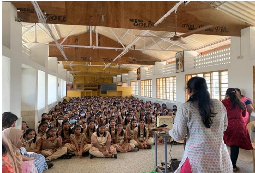
Health Education on Menstrual Hygiene