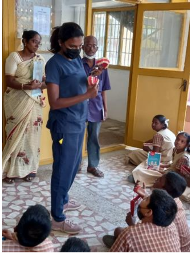
Dental Health Education