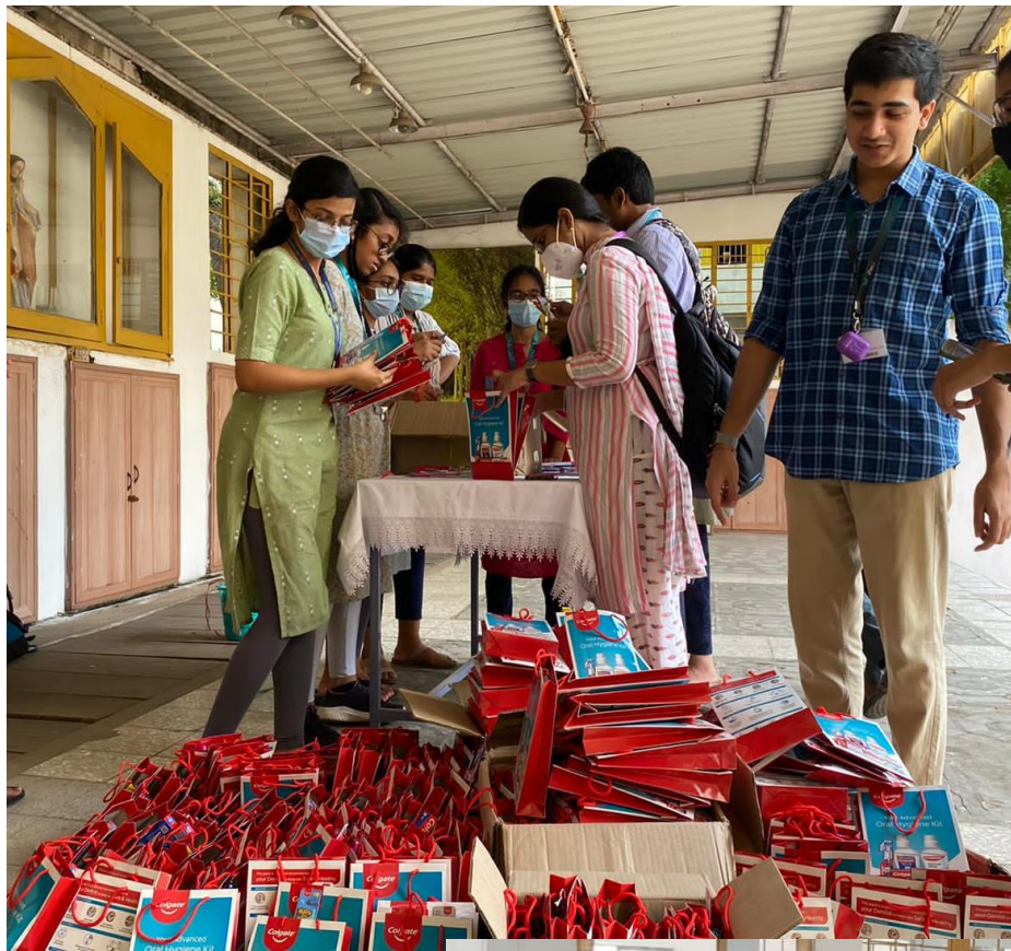
Dental Kit getting ready for distribution