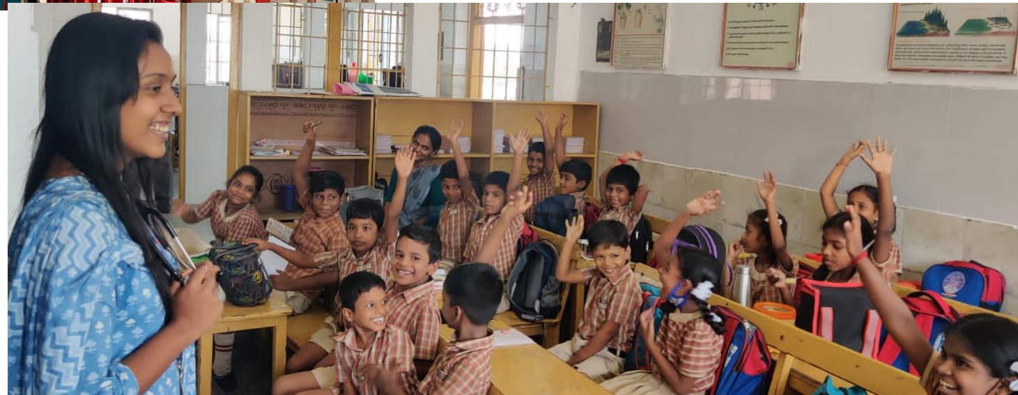
Health education on healthy diet