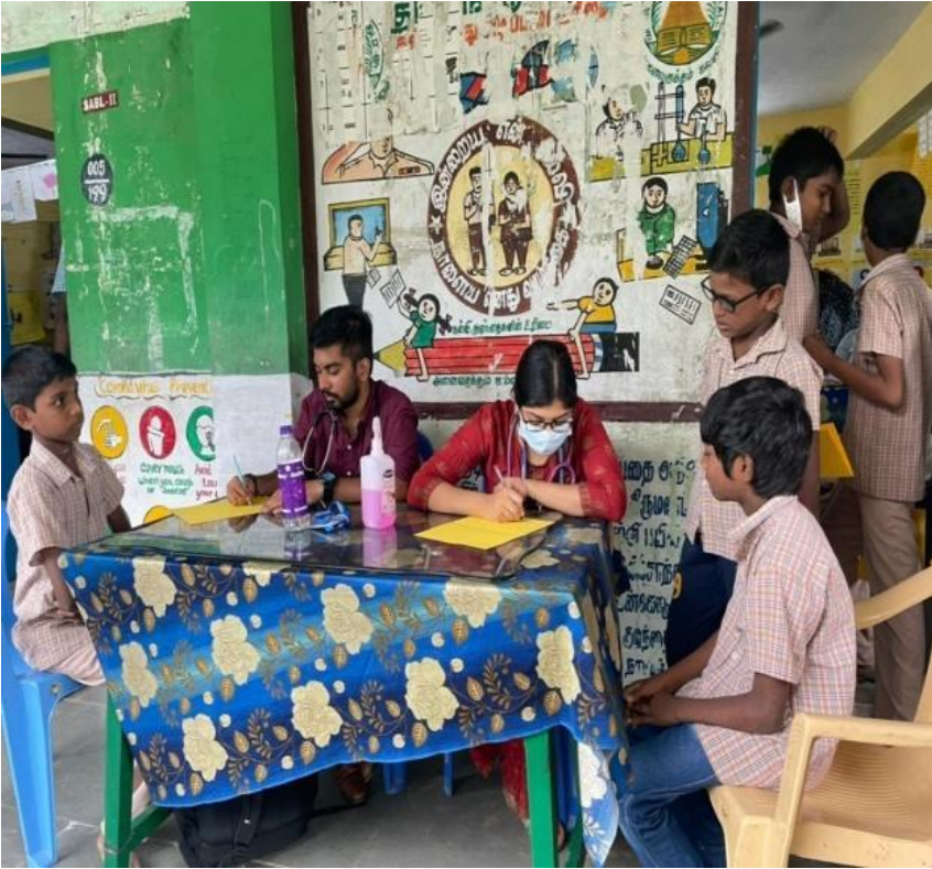
General health screening